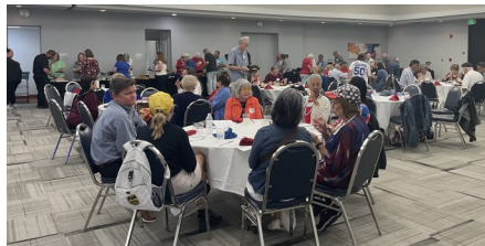
Title—RESDC Holiday Luncheon 2024; Clockwise from top left—Walk4Alz with Team RESDC; RESDC Health Fair Picnic 2025; Flag Day Luncheon 2025; Public Transit Field Trip

The County of San Diego's Deferred Compensation Program administration is moving to Empower effective December 10, 2025! If you have money in either the County's 457(b) and/or 401(a) Deferred Compensation plans, you should have received an email from Empower on or around November 4 advising you of the change of plan administrators from Nationwide to Empower effective December 19, 2025. If you did not receive an email or have misplaced it, please go to https://i.emlfiles4.com/cmpdoc/2/2/7/8/5/3/files/4122_100724-fbk-wf-4855100-1125_sox_1022_web.pdf to get a copy of the Transition guide. □