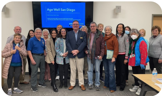
Age Well General Membership Meeting