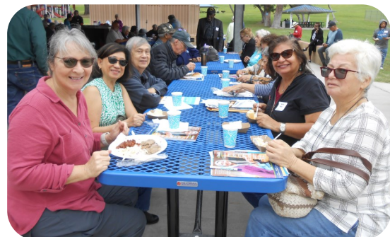
Health Fair Picnic