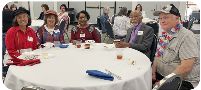
Flag Day Luncheon