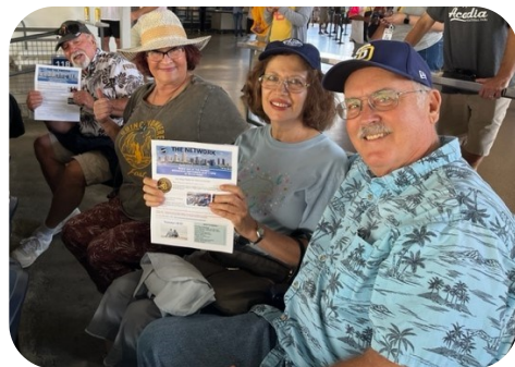
Day at the Padres