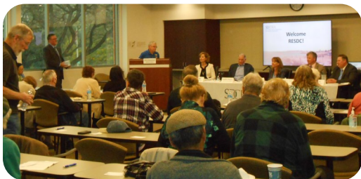
Meet the SDCERA C-Suite General Membership Meeting