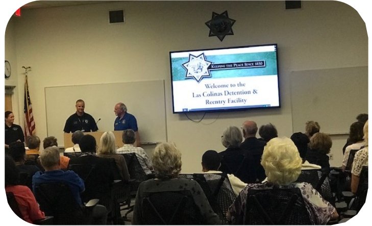
The annual Coming Home event was held in October at Las Colinas Detention and Reentry Facility.