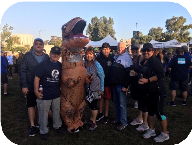
Team RESDC walked in the 2019 Walk4ALZ in October.