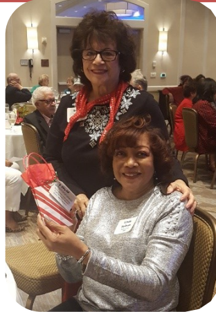
Members celebrated the holidays at our last event of the year. The annual Holiday Luncheon was held on December 12th at a new venue this year in Mission Valley at the DoubleTree Hazard Center.