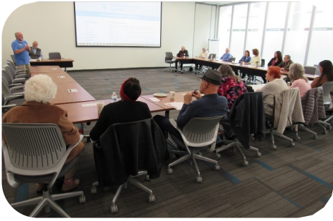
The February General Membership Meeting was held in Escondido.