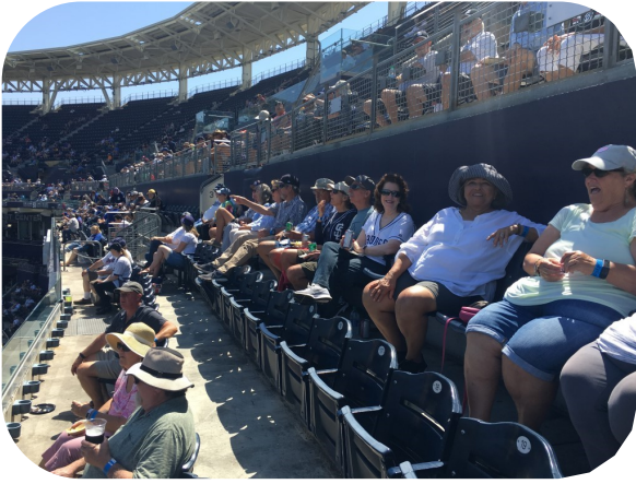
RESDC members attended a Padres game together in September.