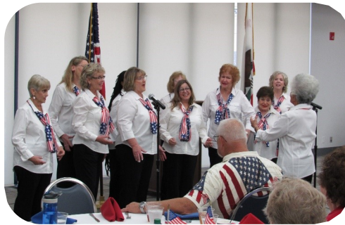
The Flag Day/Independence Day Luncheon was held at The Ronald Reagan Community Center in El Cajon.