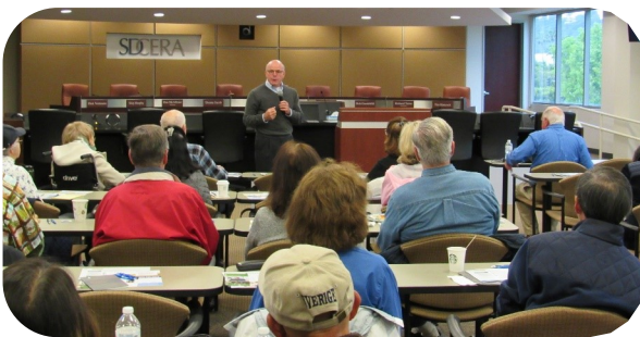
The May General Membership meeting was held at SDCERA.