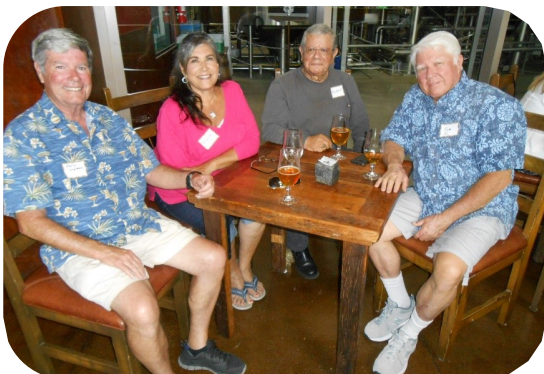
Members attended the July RESDC Roundup in Escondido.