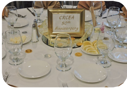
In April, RESDC hosted the CRCEA 50th Anniversary Conference.