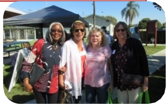
The annual Health Fair Picnic was held in October at Admiral Baker Field.