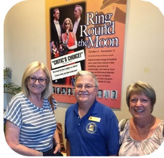
RESDC Members enjoyed a fun Theatre Outing in November at Lamb's Players Theatre in Coronado.