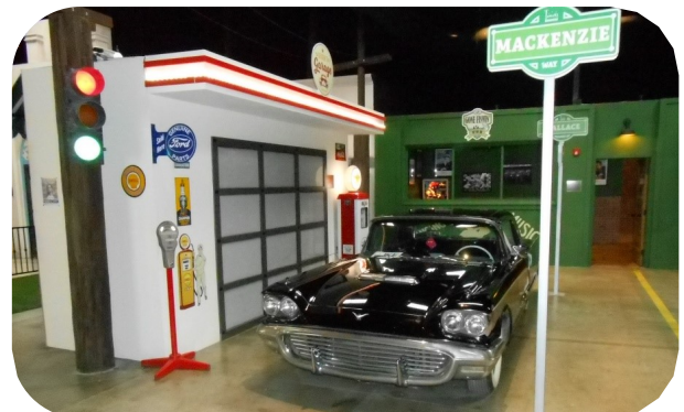
The August General Membership Meeting was held in Chula Vista at the Glenner Centers' Town Square.