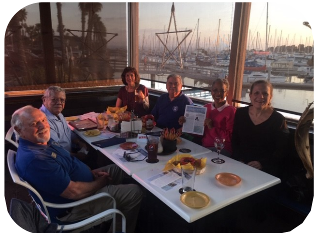
The South County RESDC Roundup was held in November in Chula Vista.