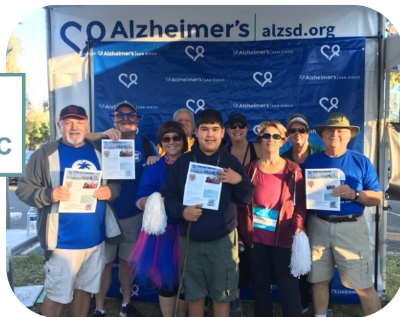
2018 Walk4ALZ Team RESDC