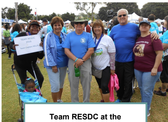
Team RESDC at the 2016 Walk4ALZ

Opening Ceremony at 7:30 am | Walk at 8:00am